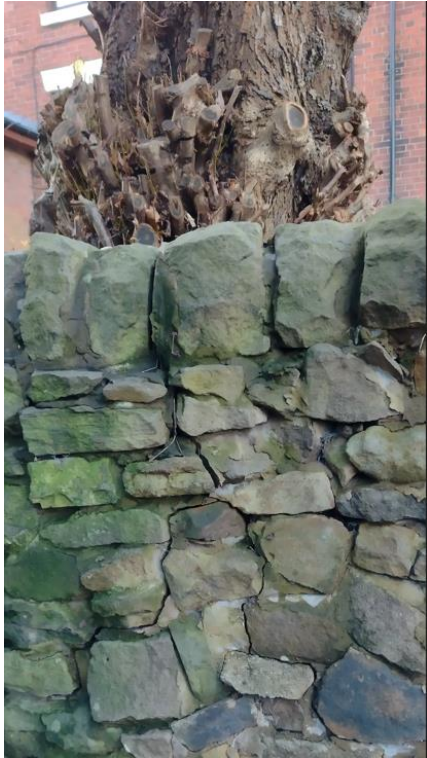
Image 3: Photo of lime tree adjacent to boundary wall – taken 24 th November 2023.