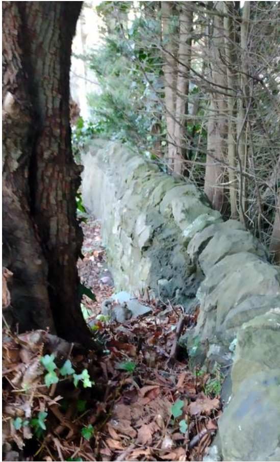
Image 2: Image of tree and boundary wall – taken 24 th November 2023.