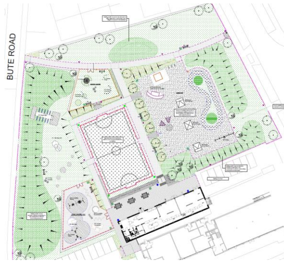
Fig 2: Proposed site layout plan