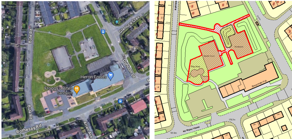
Fig 1: Satellite image and location plan