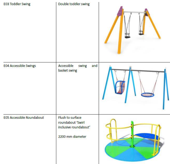
Fig 4: Excerpt from new play equipment schedule