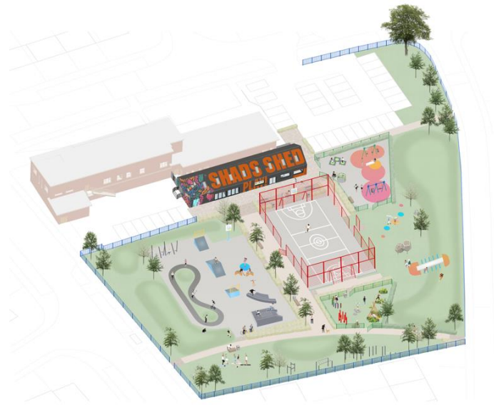
Fig 5: Visualisation of upgraded park facilities